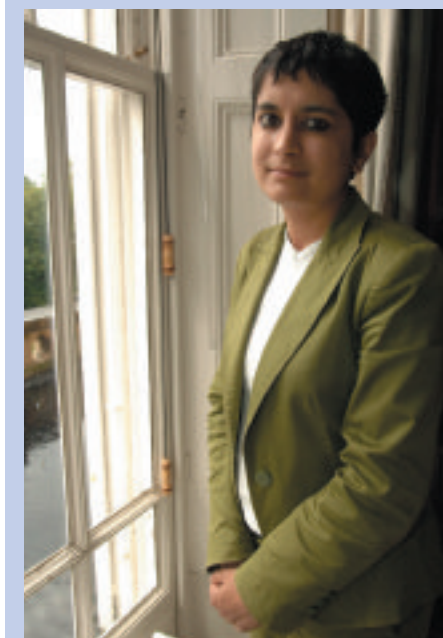
Shami Chakrabarti: May 2009, chosen object Delacroix's Liberty Leading the People.

Shami Chakrabarti was a popular Chancellor of Oxford Brookes University when we cast her away. Her length of tenure was from 2008-2015. At that time the human rights lawyer was director of LIBERTY. She stepped down from that post in March this year. She said: "How do we keep up the fight for democratic values? With solidarity and storytelling."