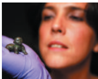
Bettany Hughes: December 2009, chosen object a 3,500-year-old votive offering in the shape of a baby, discovered by Arthur Evans in Crete and now in the Ashmolean.

When I interviewed her in 2009, Bettany was about to be one of the speakers at the academic opening of the new Ashmolean. She described how it had played an inspirational role at the start of her career. Hers