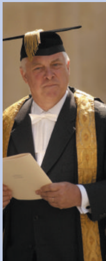
Lord Patten of Barnes: February 2014, chosen object Tang dynasty horse and rider.

Chris Patten is Chancellor of the University of Oxford for life. In his interview the Chancellor talked about Oxford and China. He described his role as governor of Hong Kong as: "The best job I ever had. I was in effect an all-powerful mayor of one of the greatest cities in Asia, a city of 6.5m people which, when I left in 1997, responsible for 22 per cent of the whole China's GDP (gross domestic product)"